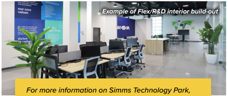
Example of Flex/R&D interior build-out

Simms Technology Park is located at the intersection of W 112th Avenue and Simms Street in Broomfield, CO. Upon completion, the project will contain 202,400 square feet of multi-story Class 'A' office, 104,720 square feet of single-story office, 262,520 square feet of flex/R&D space, and 8,380 square feet of retail space. Development plans also include up to 6.82 acres of land for pad site use.