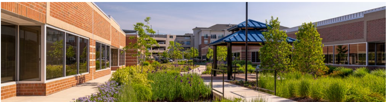
Green space amenity