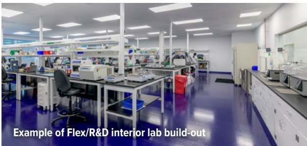
Example of Flex/R&D interior lab build-out