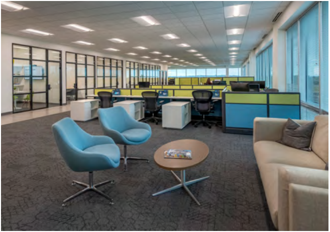
Multi-story class 'A' office build-out