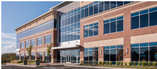
6201 Greenleigh Avenue