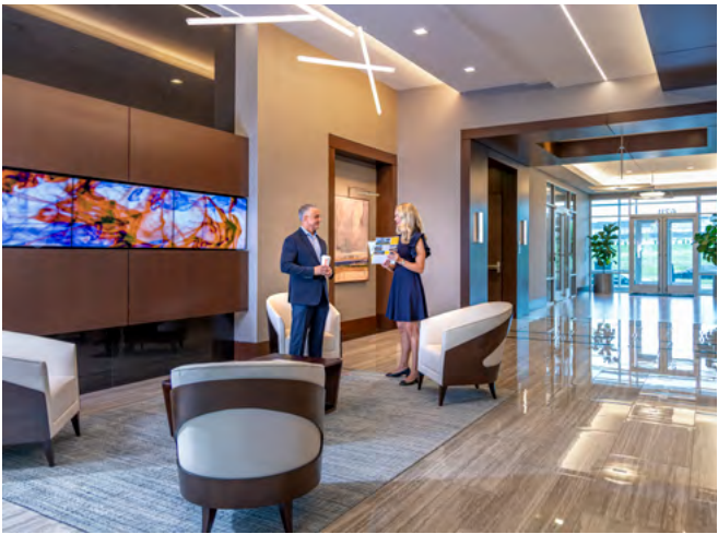
6211 Greenleigh Avenue, class 'A' office lobby