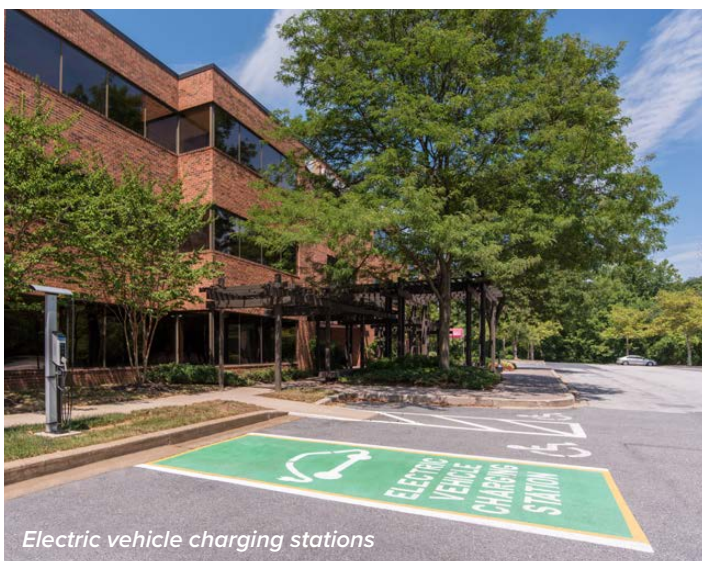
Electric vehicle charging stations