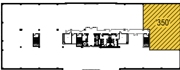
KEY PLAN NOT TO SCALE

Third floor office suite with private offices and open office area