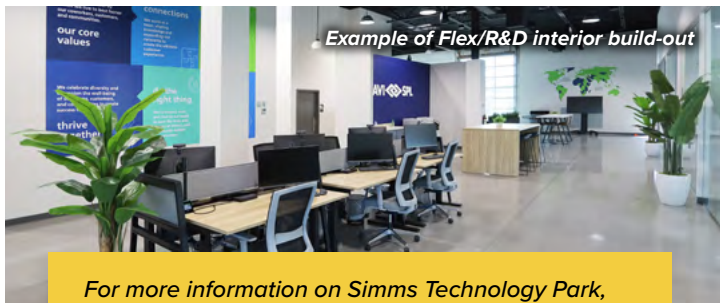
Example of Flex/R&D interior build-out