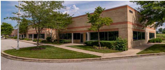
17001 Science Drive

Melford Town Center's single-story office building is located along Science Drive and offer businesses direct-entry 24/7 access.