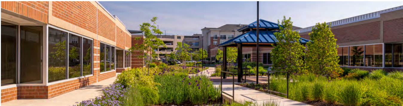
Green space amenity