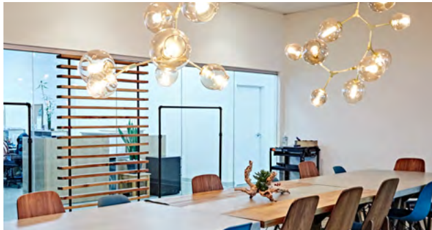
Single-story office interior build-out

In total, Greenleigh includes eight single-story office buildings totaling nearly 250,000 square feet of space. Tenant sizes range from 1,384 square feet to 40,800 square feet, and offer businesses direct-entry access 24/7. Green space amenities are abundant throughout the campus, which features a putting green.