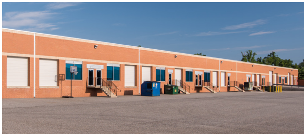
Flex/R&D dock and drive-in loading

Upon completion, Greenleigh will comprise of 18 flex/R&D buildings, totaling more than 763,200 square feet of space. Tenant sizes from 2,520 square feet to 59,400 square feet of space offer businesses straight-forward, economical and high-utility space. These flexible buildings allow for dock and drive-in loading with wide truck courts.