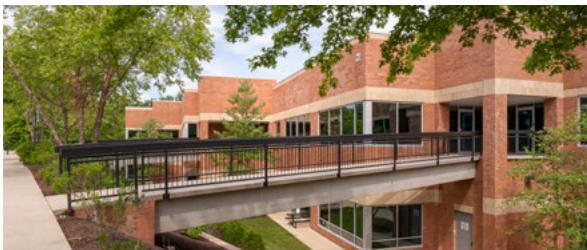
16900 Science Drive

Melford Town Center's two-story office buildings located along Science Drive offer an over-and-under style of architecture. This style provides direct street access from the second floor.