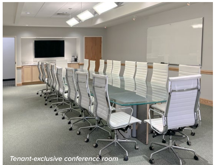
Tenant-exclusive conference room