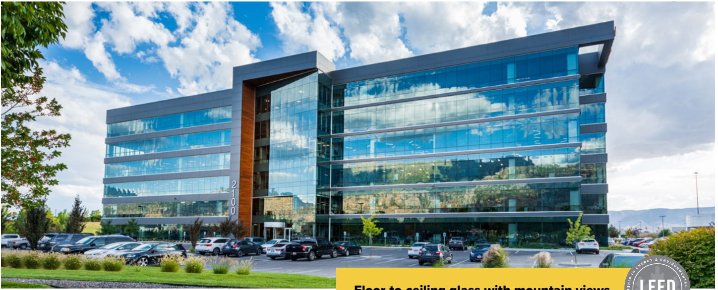
Floor-to-ceiling glass with mountain views