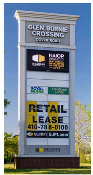
Electronic Pylon Sign