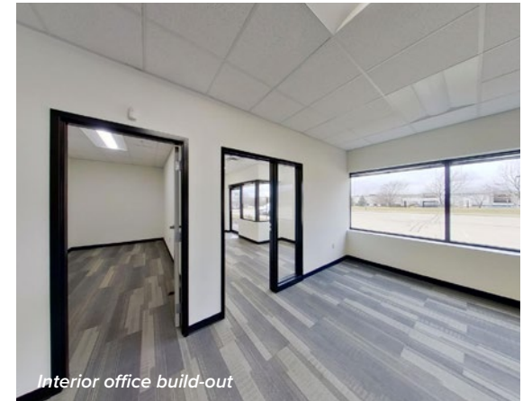
Interior office build-out