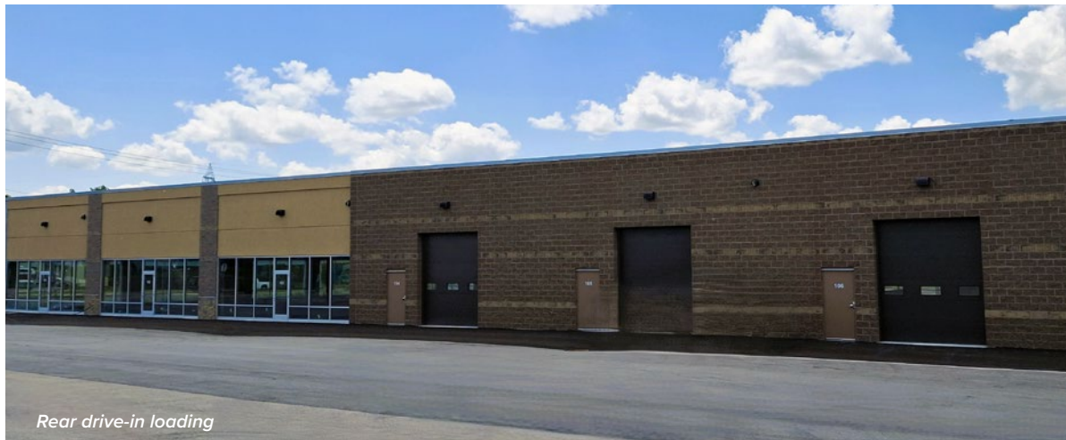
Rear drive-in loading