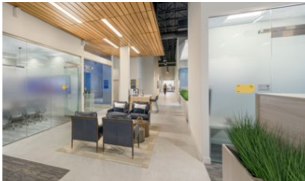
Above: Flex/R&D interior office build-out Below: Flex/R&D Warehouse/lab build-out