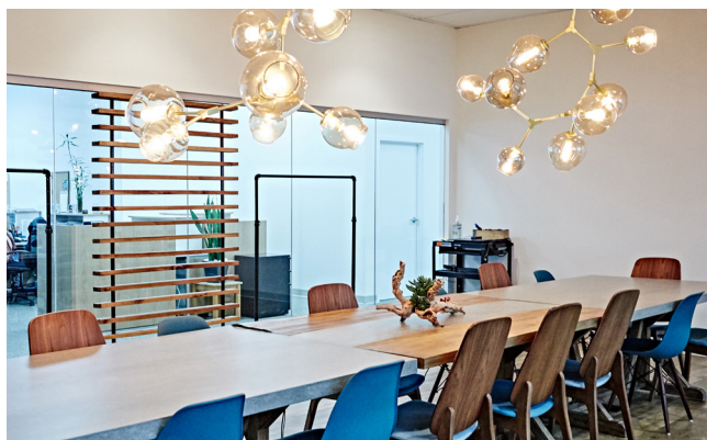
Single-story office interior build-out