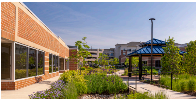
Green space amenity

In total Greenleigh will include 18 single-story office buildings, totaling more than 460,000 square feet of space. Tenant sizes range from 1,384 square feet to 40,800 square feet and offer businesses direct-entry access 24/7. Green space amenities are abundant throughout the campus, which features a putting green.