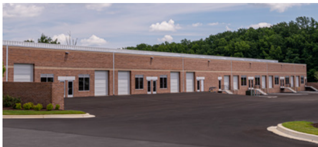
Top: Electric vehicle charging stations at 4961 Tesla Drive; Bottom: Drive-in loading with wide truck court