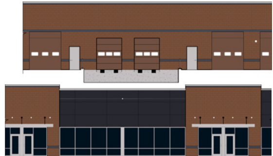
Future flex/R&D with dock/drive-in loading

Rawson Avenue Business Center II consists of more than 152,800 square feet of office/retail and flex/R&D space. The business center is located just east of E. Rawson Avenue and S. Howell Avenue, just 2 miles east of Interstate 94. The project offers great visibility to the busy Howell Avenue corridor.