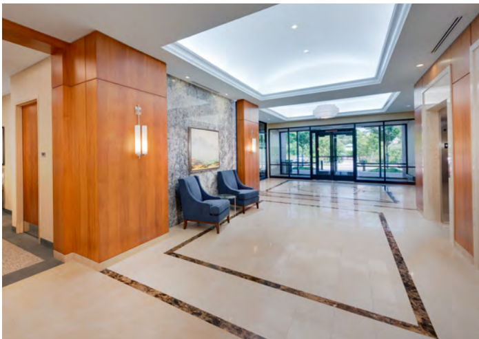
Below, From Top to Bottom: Interior lobby of 181 Harry S. Truman Parkway; Courtyard amenity at Annapolis Corporate Park

Annapolis Corporate Park is just five miles from downtown Annapolis, with quick connections to Baltimore, Columbia, and DC markets, as well as BWI Airport.