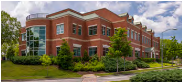
17251 Melford Boulevard

Melford Town Center includes three Class 'A' multi-story office buildings totaling more than 327,000 square feet of space. Tenant sizes from 1,252 square feet to 150,000 square feet of space offer businesses headquarters-worthy location.