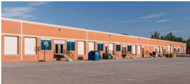
Flex/R&D dock and drive-in loading

Upon completion, Greenleigh will comprise of 18 flex/R&D buildings, totaling more than 763,200 square feet of space. Tenant sizes from 2,520 square feet to 59,400 square feet of space offer businesses straight-forward, economical and high-utility space. These flexible buildings allow for dock and drive-in loading with wide truck courts.