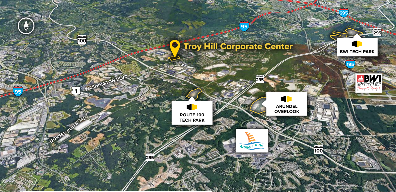
Google Imagery ©2021 Google, Imagery ©2021 Commonwealth of Virginia, Maxar Technologies, U.S. Geological Survey, USDA Farm Service Agency, Map data ©2021