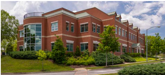
17251 Melford Boulevard

Melford Town Center includes three Class 'A' multi-story office buildings totaling more than 327,000 square feet of space. Tenant sizes from 1,252 square feet to 150,000 square feet of space offer businesses headquarters-worthy location.