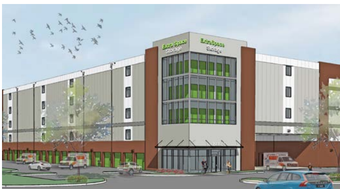
▲ 981 Waugh Chapel Way, self-storage rendering