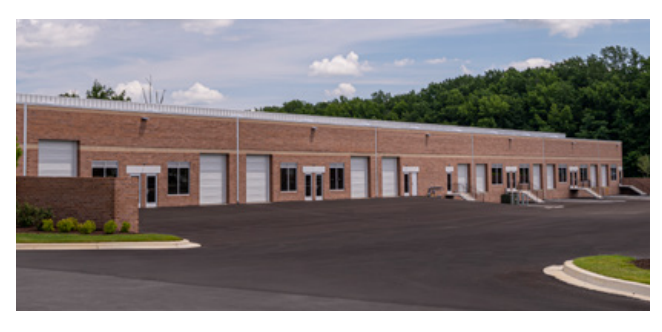
Top: Electric vehicle charging stations at 4961 Tesla Drive; Bottom: Drive-in loading with wide truck court