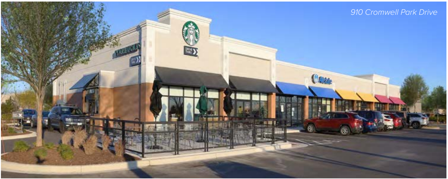
910 Cromwell Park Drive