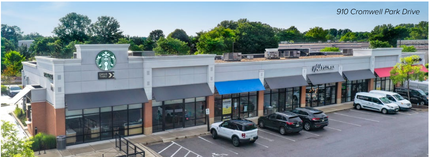
910 Cromwell Park Drive