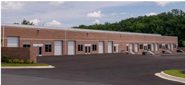
Top: Electric vehicle charging stations at 4961 Tesla Drive; Bottom: Drive-in loading with wide truck court