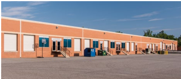
Flex/R&D dock and drive-in loading

Upon completion, Greenleigh will comprise of 18 flex/R&D buildings, totaling more than 763,200 square feet of space. Tenant sizes from 2,520 square feet to 59,400 square feet of space offer businesses straight-forward, economical and high-utility space. These flexible buildings feature dock and drive-in loading with wide truck courts.