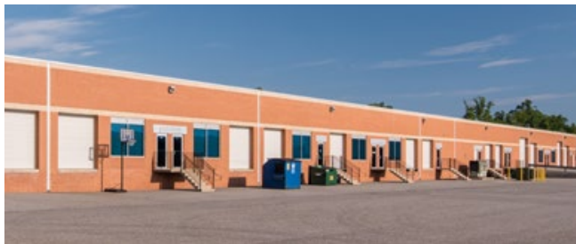
Flex/R&D dock and drive-in loading

Upon completion, Greenleigh will comprise of 23 flex/R&D buildings, totaling more than 950,000 square feet of space. Tenant sizes from 2,520 square feet to 59,400 square feet of space offer businesses straight-forward, economical and high-utility space. These flexible buildings allow for dock and drive-in loading with wide truck courts.