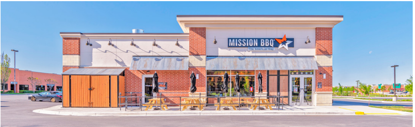
5102 Pegasus Court

For more information on Westview Exchange, visit: sjpi.com/westview