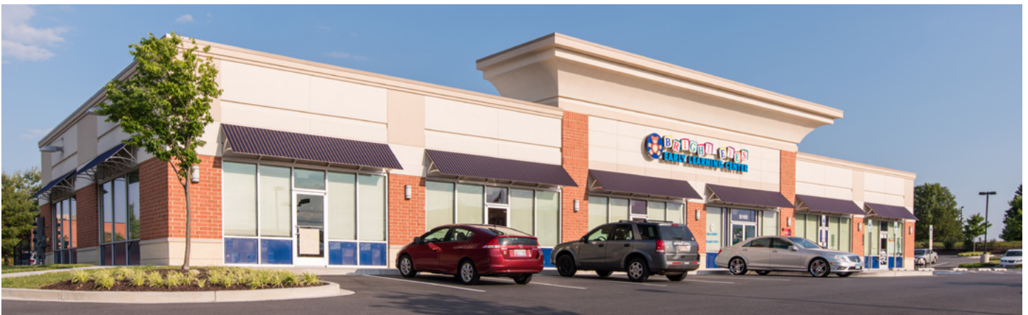
5105 Pegasus Court