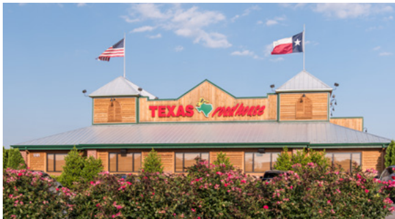
5101 Pegasus Court

Westview Exchange is located at the entrance to the 49-acre Westview Business Park with 439,710 square feet of office/flex and retail space. The project is directly across from Westview Promenade. Westview Exchange is home to Texas Roadhouse, Chili's, Mission BBQ, McCormick Paints, and Bright Eyes Early Learning Center. Inline retail space with up to 8,515 square feet of space now available. Ample parking and on-site businesses located at the adjacent Westview Business Park make Westview Exchange an ideal setting for retailers.