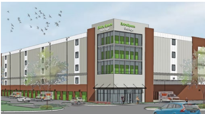
▲ 981 Waugh Chapel Way, self-storage rendering