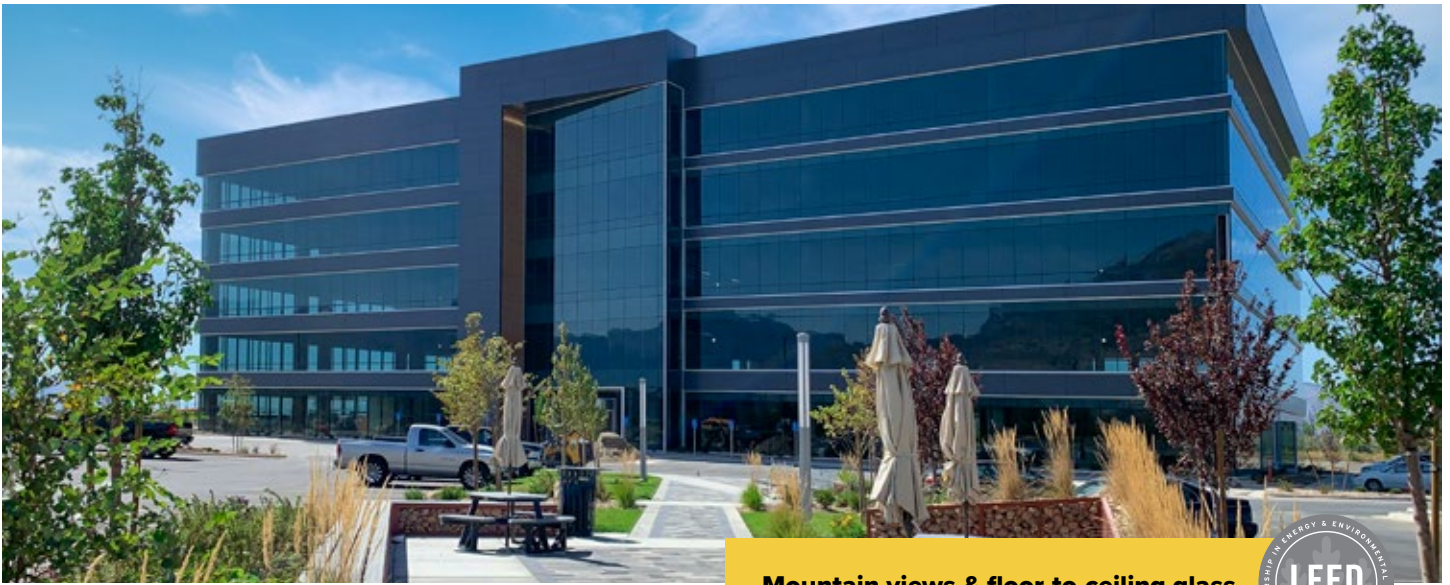
Mountain views & floor-to-ceiling glass