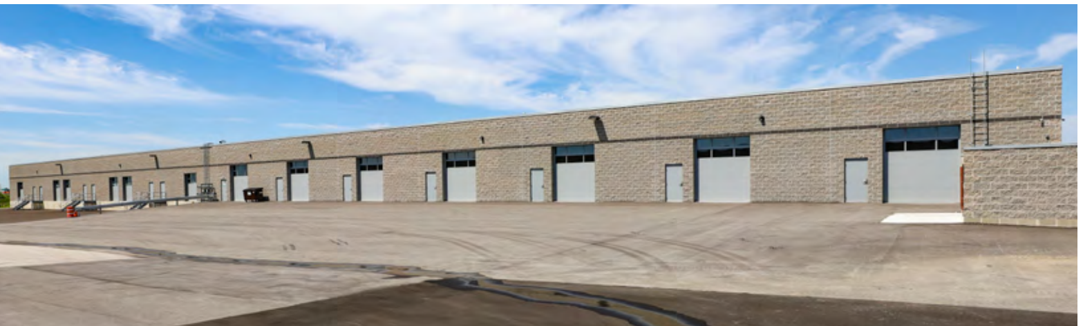
Above, from top to bottom: Sport court amenity; front of single-story office building; rear loading of flex/R&D building