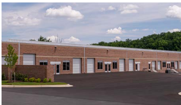
Above, top to bottom: Electric vehicle charging stations at 4961 Tesla Drive; drive-in loading with wide truck court