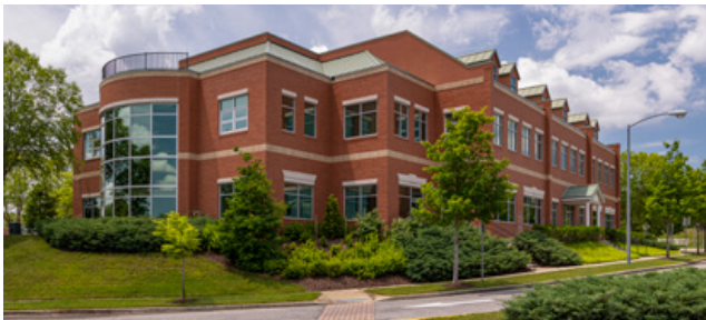
17251 Melford Boulevard

Melford Town Center includes three Class 'A' multi-story office buildings totaling more than 327,000 square feet of space. Tenant sizes from 1,252 square feet to 150,000 square feet of space offer businesses headquarters-worthy location.