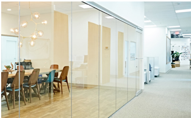
Single-story office interior build-out