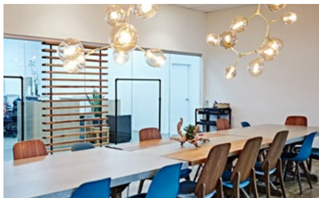
Single-story office interior build-out