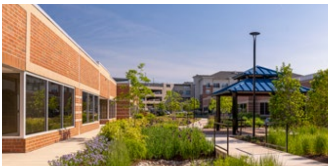
Green space amenity

In total Greenleigh will include 18 single-story office buildings, totaling more than 460,000 square feet of space. Tenant sizes range from 1,384 square feet to 40,800 square feet and offer businesses direct-entry access 24/7. Green space amenities are abundant throughout the campus, which features a putting green.