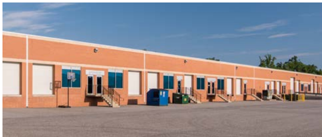
Flex/R&D dock and drive-in loading

Greenleigh is comprised of 23 flex/R&D buildings, totaling more than 950,000 square feet of space. Tenant sizes from 2,520 square feet to 59,400 square feet of space offer businesses straight-forward, economical and high-utility space. These flexible buildings allow for dock and drive-in loading with wide truck courts.