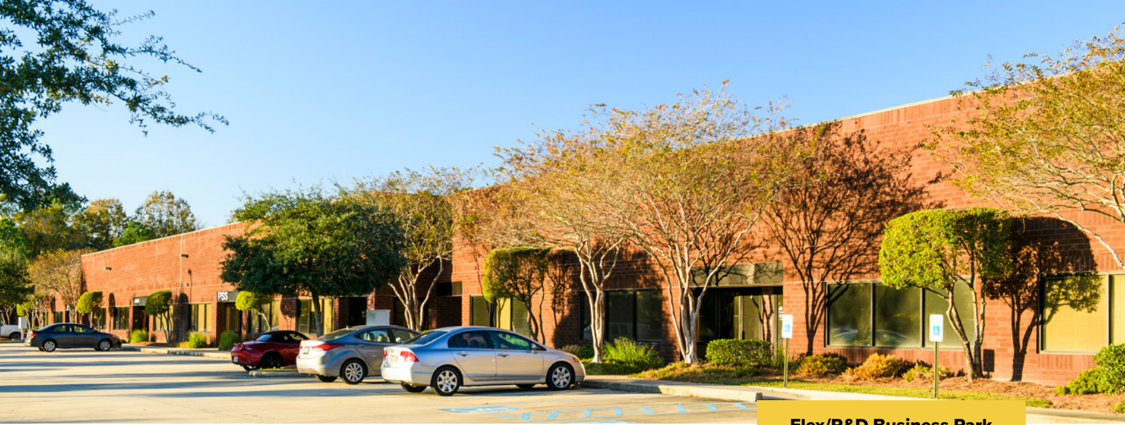
Flex/R&D Business Park