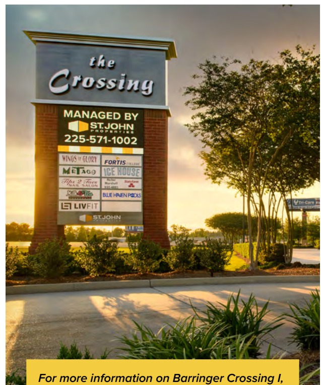
For more information on Barringer Crossing I, visit: sjpi.com/barringer1