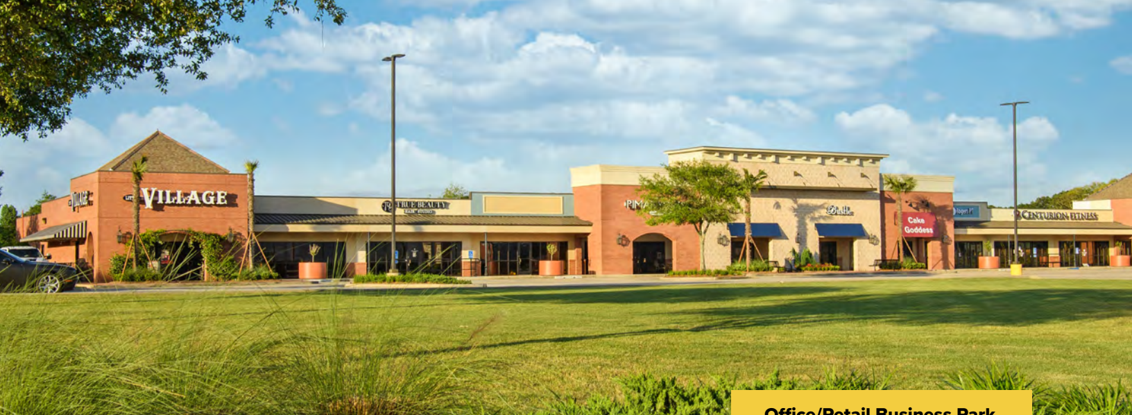
Office/Retail Business Park