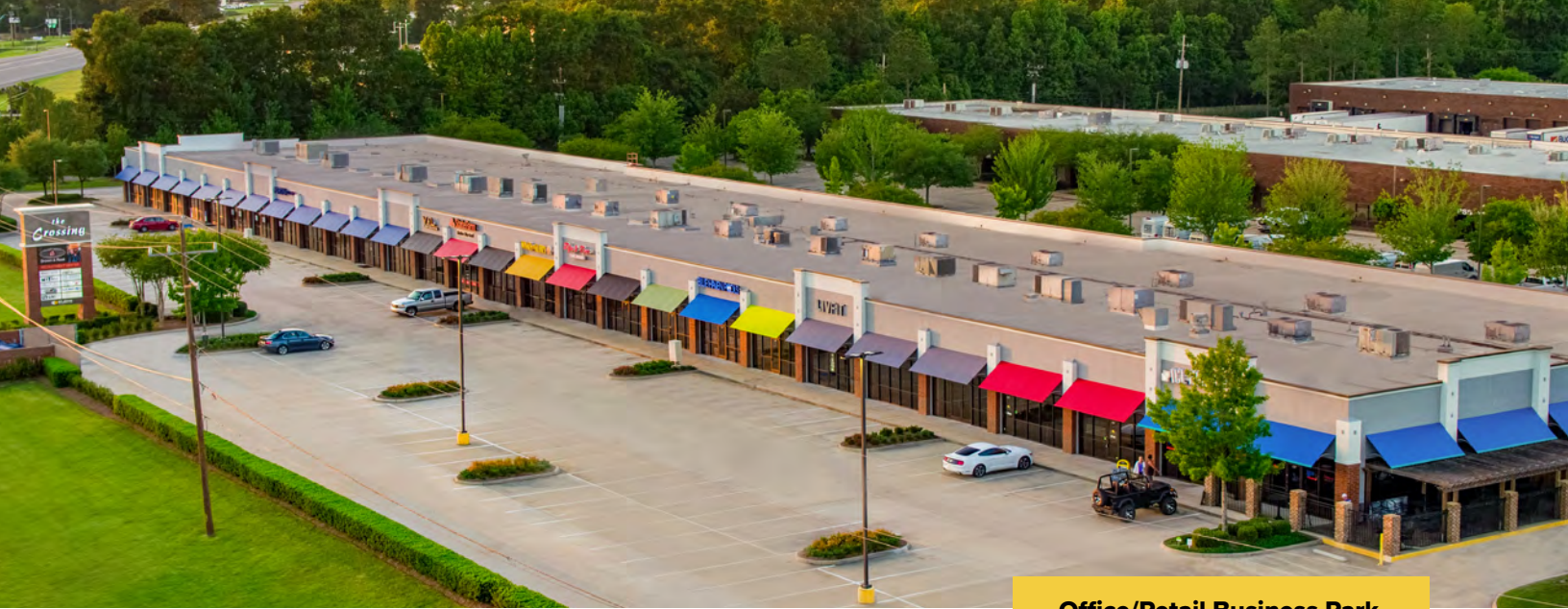
Office/Retail Business Park